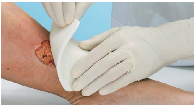
For use as wound cover.

Cutimed® Cavity is a sterile dressing, made from hydrophilic, absorbent polyurethane foam. It is soft, highly absorbent and conformable, creating the ideal environment for moist wound healing.