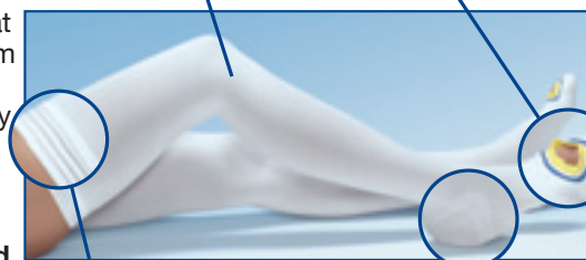
Skin-friendly thigh band